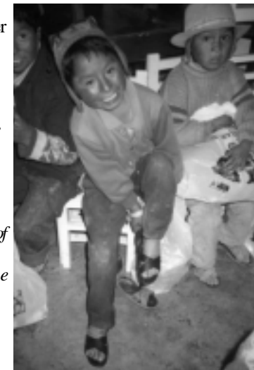
Cha'lla's children: each one was given a bag containing a jumper, sandals, a toy and some sweets