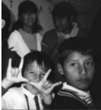
'I love you' crosses every barrier

8 New commitment. Many thanks for praying for The Big Bond at the end of November. This