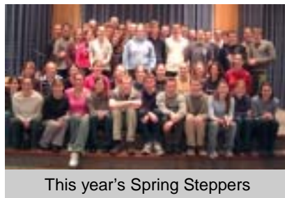
This year's Spring Steppers