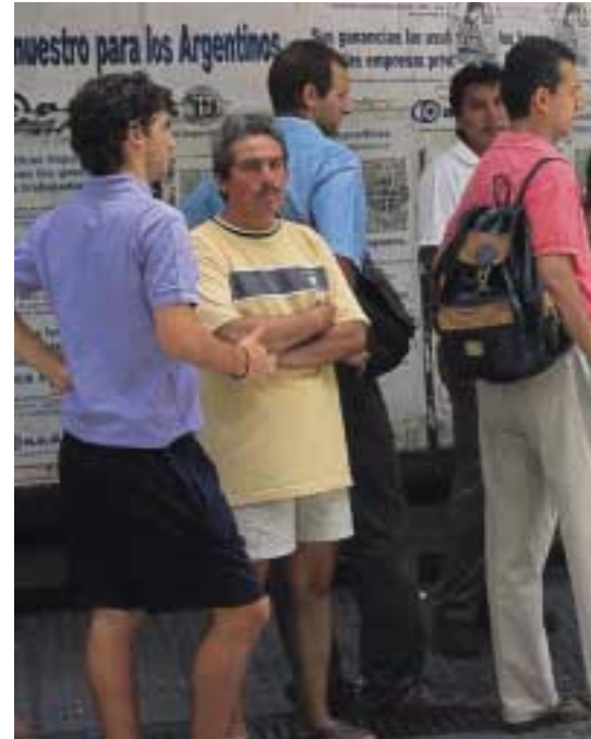
Queuing for three hours outside a bank is normal these days